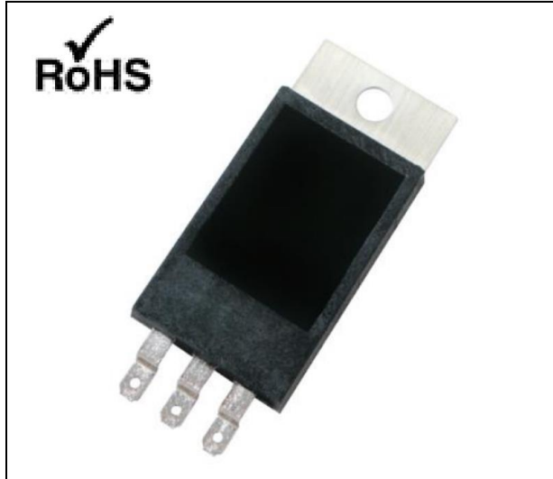
SiC Schottky Diode 100 Amperes / 3300 Volts

Silicon Carbide Schottky Discrete Diode 100 Amperes / 3300 Volts